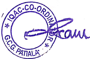
Principal Govt. College for Girls Patiala